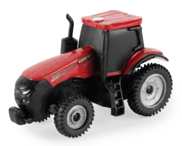
1:64 Case IH AFS Connect™ Magnum™ 380 Tractor

Part No. ZFN47166 Case Pack: 4 - Age grade: 3+