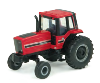
1:64 International Harvester™ Tractor

Part No. ZFN46709 Case Pack: 4 - Age grade 3+